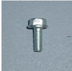
8mm x 20mm Bolt