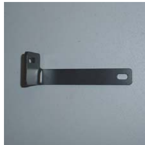
DP Support Bracket