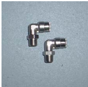
90° QC Swivel