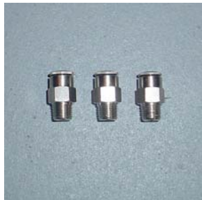
Straight QC Fittings