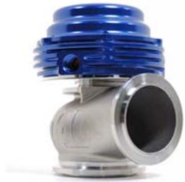
Tial MV-S 38mm Wastegate with V-band Clamps