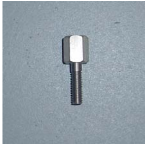
6.7L Boost Bolt