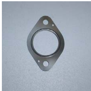
Gate Mount Gasket