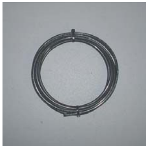
15' Coil 1/4" Air Line