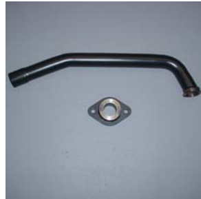
Downpipe & Mount